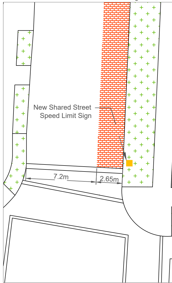
10th Street and 14th Avenue Changes